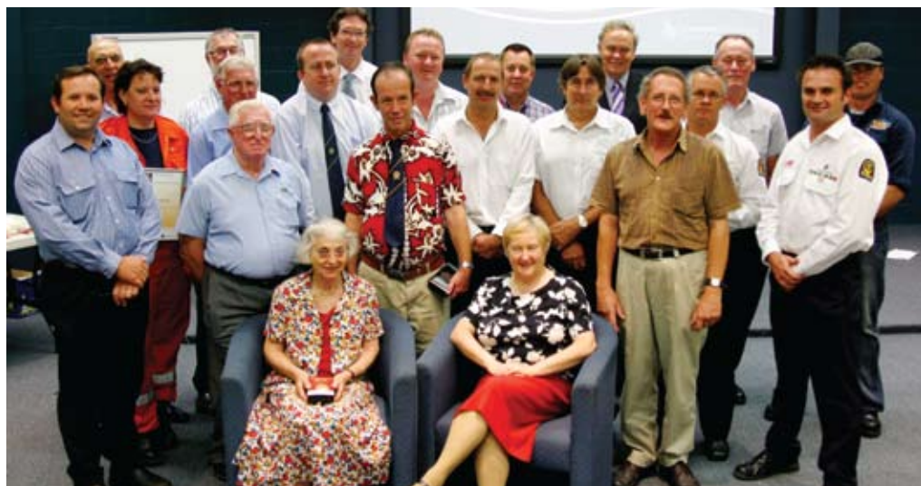
SES volunteers from Brisbane, Redcliffe, Caboolture, Redlands and Beaudesert units were recognised by their peers at a medal ceremony recently.

Ms Fyfe was presented with an Outstanding Service Certificate.